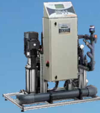
NUTRIGATION, MONITORING & CONTROL